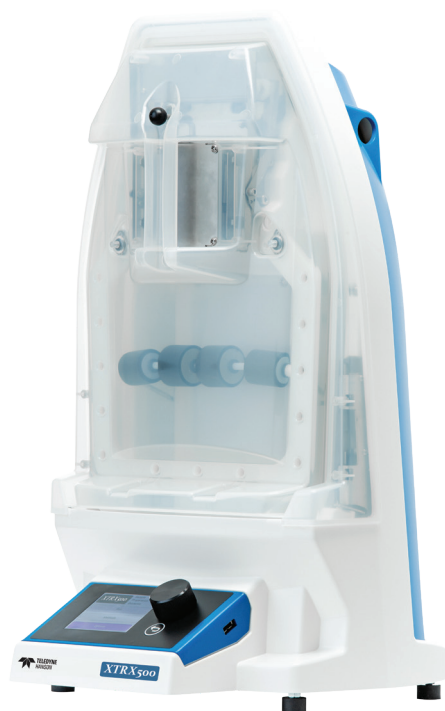
Teledyne Hanson Sample Preparation Extractor

As samples are prepared within chemically compatible, single-use recyclable pouches, XTRX500 eliminates many of the problems associated with handling glassware, manual crushing, dry material measurement and transfer, cleaning validation, and the reproducibility errors inherent in manual sample-prep methods.