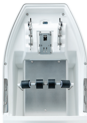
Mixer bar with four rollers reciprocates at 2 Hz to generate high fluid turnover.