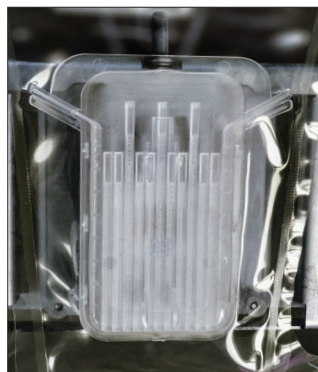
Heavy duty polypropylene crushing plates pulsate at high frequency inside the extraction pouch.

When crushing and mixing are complete with the sample fully dissolved, the analyst uses a syringe to extract the aliquot(s) required by the analytical method and places them into appropriate vials for transfer. The pouch is removed from the cassette, emptied, and recycled or disposed of according to the lab's standard operating procedures.