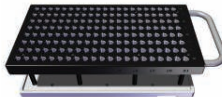
Collection Rack for 12 x 32 mm HPLC Vials