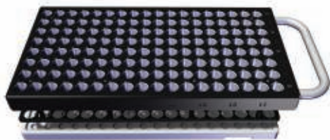
Collection Rack for 16 x 100 mm Test Tubes